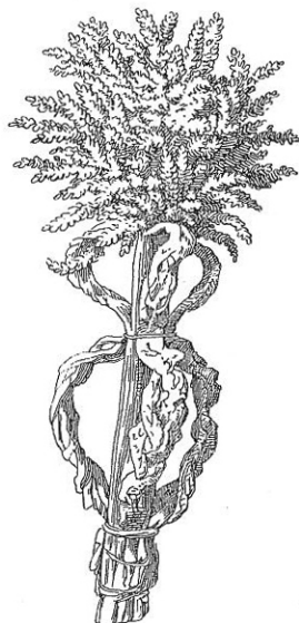
22 in. high

for many years. This "Neck" was made by a man eighty-five years of age, who is the only man in the parish now living who had made a "Neck" when the custom was in vogue.